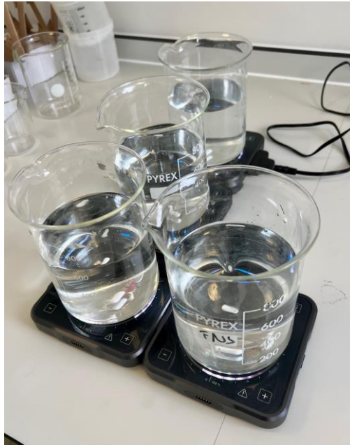
Figure 4. Four IKA Twisters powered by a single power source

A feature of the IKA Twister is it can be linked with other IKA Twisters to form multiple position stirrers powered by a single power source (Figure 4). The energy usage of multiple position stirrers was monitored at different set points (Figure 5).