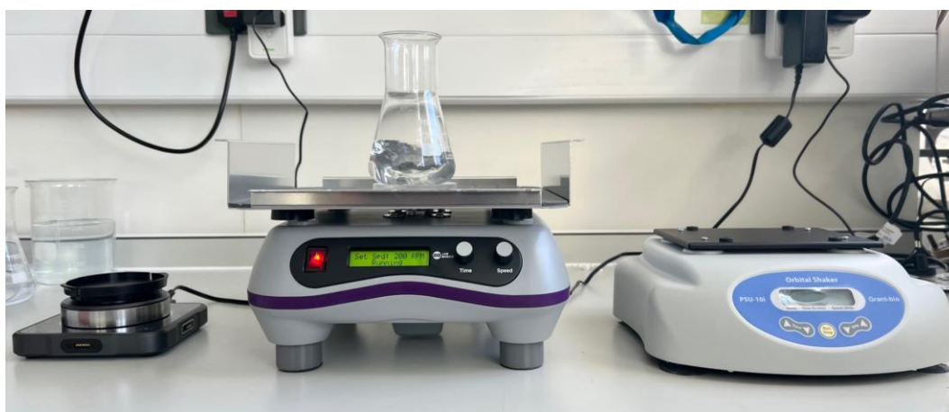
Figure 6. From left to right: the IKA Twister, SLS Lab Basics and Grant PSU-10i

With the addition of the TVWX Shaker attachment, MS 3.3 universal attachment, and STICKMAX II sticky pad, the IKA Twister was used as an orbital shaker. The IKA Twister was tested alongside two other orbital shakers at 200 RPM, with each orbital shaker agitating a single 250ml flask containing 100ml of water. Each model also employed a STICKMAX II to hold the flask in place (Figures 6 and 7).