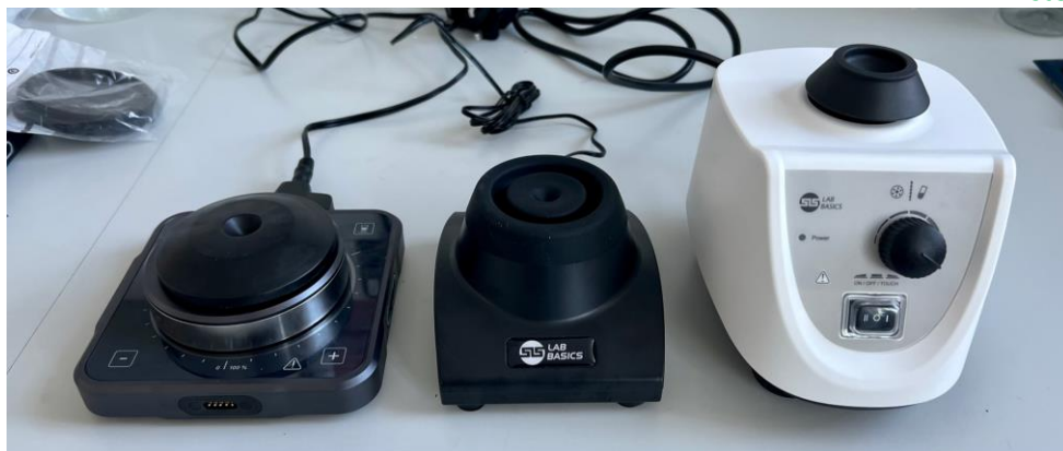
Figure 8. From left to right; the IKA Twister, SLS Vortex Mixers SLS 9602 and SLS 1620