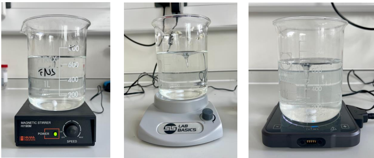
Figure 2. From left to right; Hanna HI 190M, SLS Lab Basics Stirrer, and the IKA Twister.

Alongside the IKA Twister, two magnetic stirrers were tested. All three units stirred an 800ml flask filled with 700ml of water. Both the Hanna and SLS Lab Basics stirrers (Figure 2) were operated at their maximum revolutions per minute (RPM) only. The reason being that both units had a dial control which made it difficult to set precise set points below their maximum RPM. The IKA Twister can be set to operate at increments of 100 RPM up to a maximum of 3000 RPM. The IKA Twister was also tested at its maximum RPM and also the maximum set points of the other two models (Figure 3).