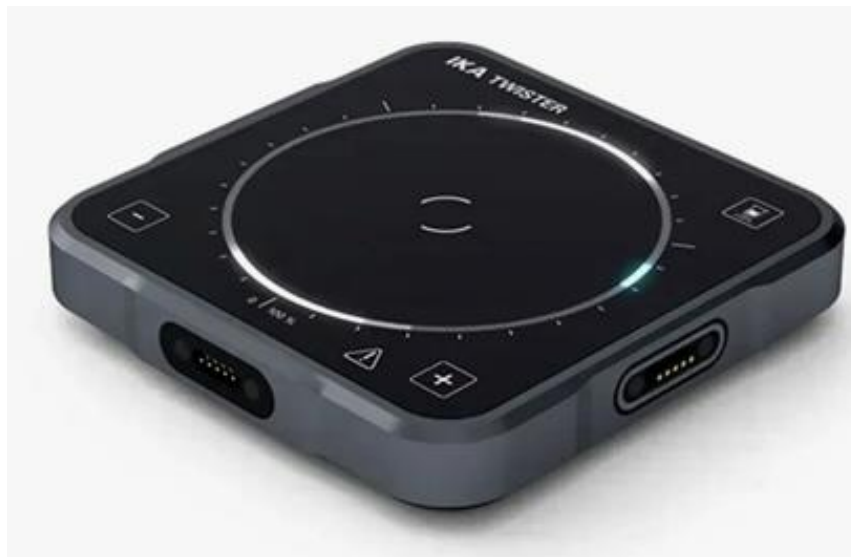
Figure 1. The IKA Twister

Wet labs employ a variety of equipment types for preparing and agitating materials. Vortex mixers, magnetic stirrers, and orbital shakers are routinely. IKA have recently released the IKA Twister (Figure 1), a product which can perform the functions of all three of these equipment types. Products such as the IKA Twister represent a response by industry to reduce the environmental impact of scientific research. Products which use less raw materials and reduce supply chain emissions are an essential component of the scientific sector becoming carbon neutral.