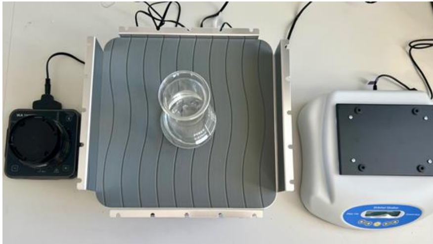
Figure 10. Varying sizes of orbital shaker platform sizes

The space occupied by each model of equipment was also measured (Figure 11). With lab space being ‘prime real estate’, the potential space saving offered by using the multifunctional IKA Twister could be advantageous to end users and technical staff.