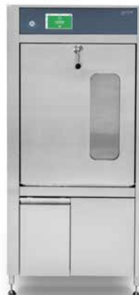
Getinge Lancer model 1400 LXP labware washer; shown with optional View-In-Process (VIP) window.