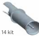
Adapt 14 kit