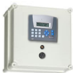
O2 depletion alarm