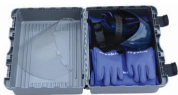
Cryogenic safety equipment