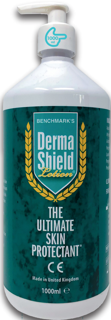
1000ml Derma Shield lotion

Order Code BOTFUL1000UK Case Quantity 6 Lead-time 5 days