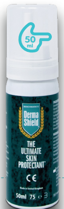
50ml Derma Shield aerosol

This size will last approximately 2 to 3 months if used twice a day on an adult pair of hands.