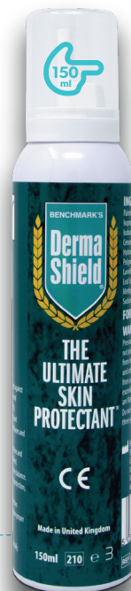
150ml Derma Shield aerosol

This size will last approximately 14 to 15 months if used twice a day on an adult pair of hands.