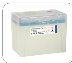
Single Tray racks purity-certified tip racks