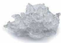
AF 87 Flake ice Residual water content 25%