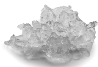
MF 36 Flake ice Residual water content 25%