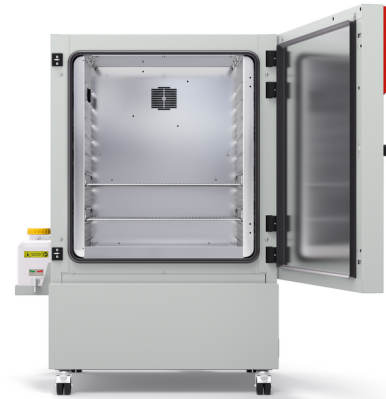
Model KBF-S ECO 240