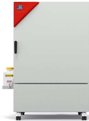
Model KBF-S ECO 240