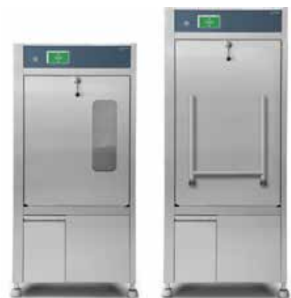
Getinge Lancer model 1600 LXP and 1600 LXP with height extension. View-in-process is optional.