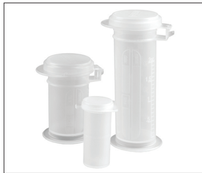
Thermo Scientific™ Capitol Vial Snappies™ Breast Milk Container System