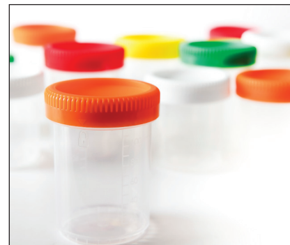
Thermo Scientific™ Samco™ Clicktainer™ Vials and Specimen Containers