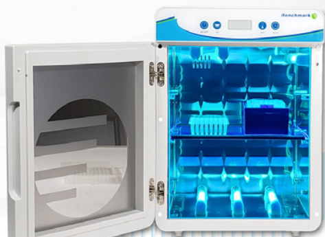
6-bulb design with UV-C transparent shelf for 360° exposure