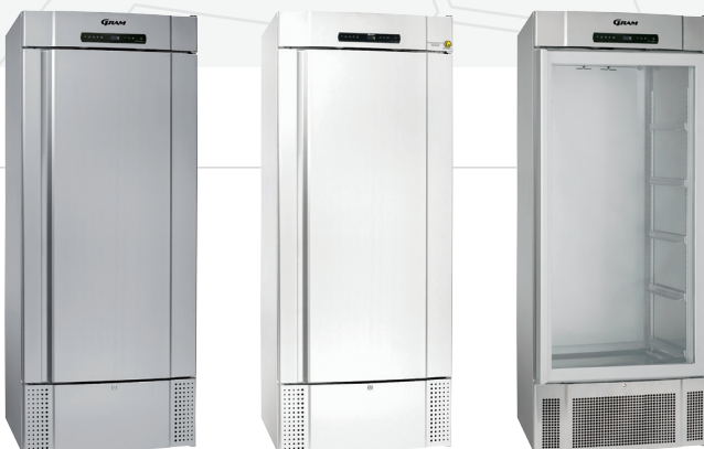
The BioMidi 625 is available as a refrigerator or freezer in either white, aluminium or stainless steel finish. All BioMidi models come with selfclosing door. Glassdoor is available for refrigerator.