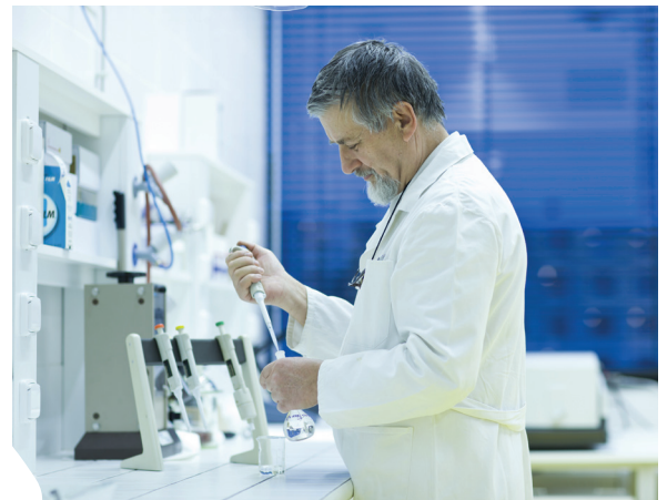
Chemistry that drives innovation

Choose a vacuum oil that will enhance performance, extend life and save energy