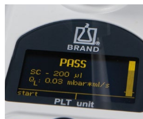
Shows the result and the deviation from the limit within seconds