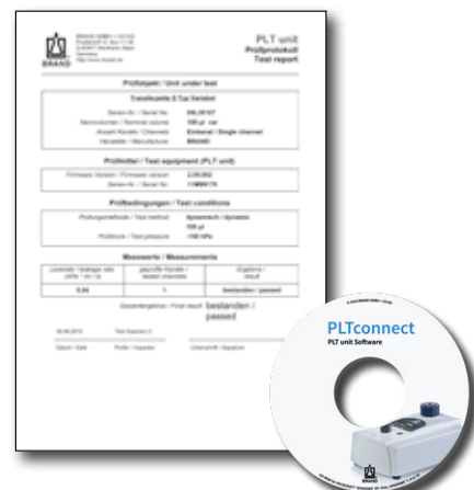
Calibration certificate of PLTconnect software