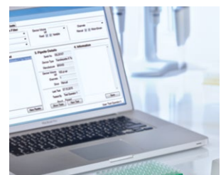
PLTconnect Software for clear documentation