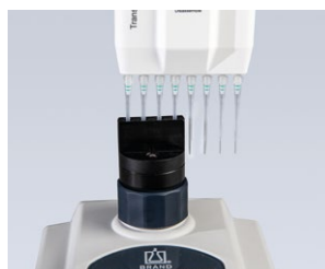
Leak test with multi-channel pipettes