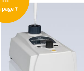
Testing with tip inserted