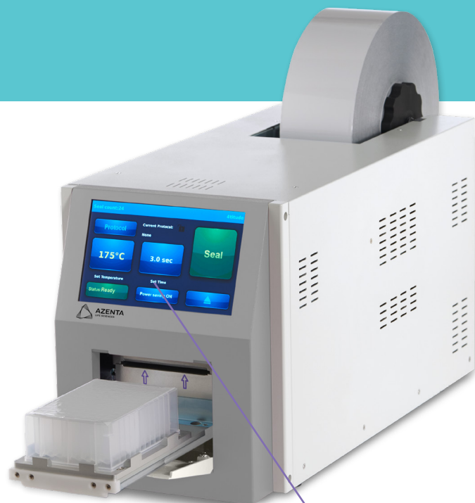
Color touch screen with intuitive user interface – ease of use