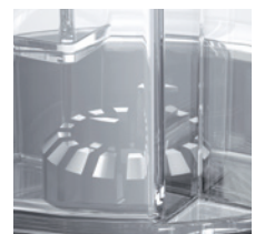
MultiDrive DI 2000 T Vessel with dispersing element