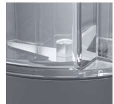
MultiDrive BL 2000 Vessel with cutter