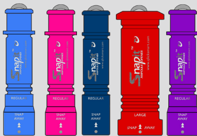
SnapIT and SnapIT Lite Ampoule Openers