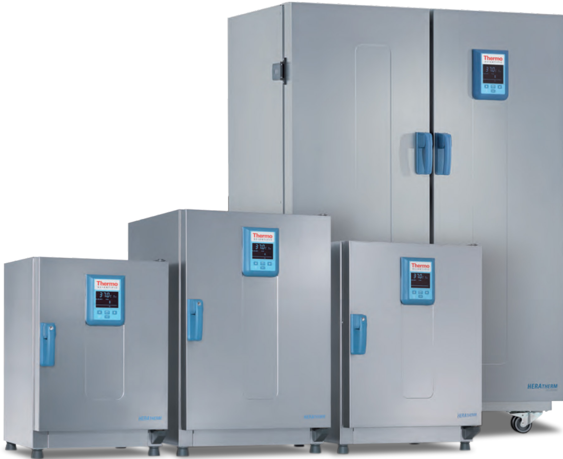
Heratherm Advanced Protocol Security microbiological incubators with stainless steel exterior

An optional stainless steel exterior is available for the Heratherm Advanced Protocol Microbiological and Advanced Protocol Security Microbiological Incubator models