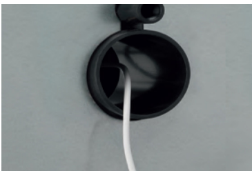
Rear view of the 100 L Advanced Protocol Smart-Vue Wireless Monitoring Solution

Find out more at thermofisher.com/incubators