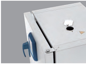
Additional access port top