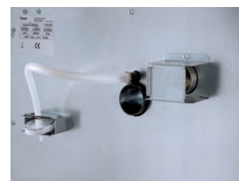
Fresh air particle filter