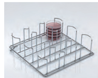
Petri dish holder