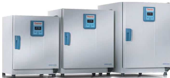
Heratherm General Protocol Microbiological Incubators, 60 L, 100 L, 180 L models