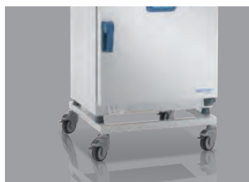
Support stand with casters