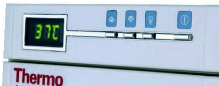
Easy to use interface