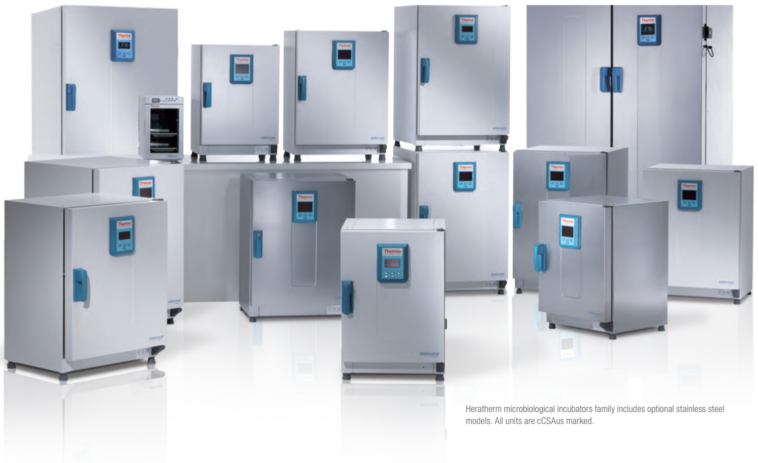
Heratherm microbiological incubators family includes optional stainless steel models. All units are cCSAus marked.