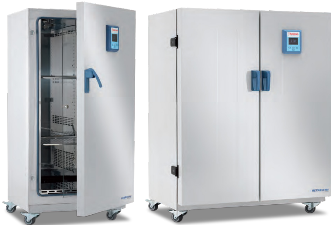
400 L and 750 L unit available

Large capacity models designed for high sample volume