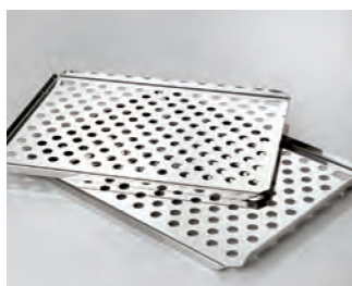
Stainless steel perforated shelves