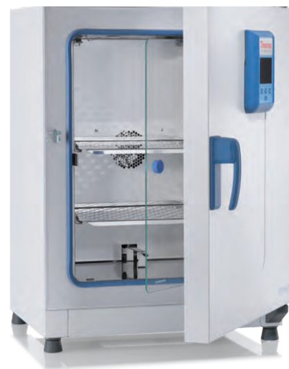
Heratherm Advanced Protocol Microbiological Incubator with unique dual convection, 180 L model pictured