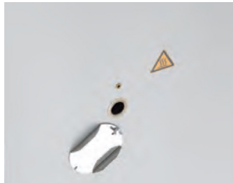
Additional access port right