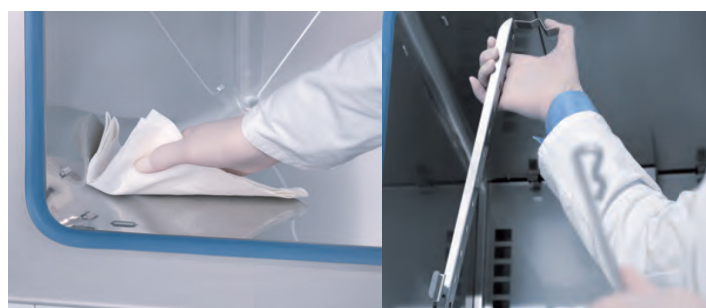
Smooth inner chamber with easy to clean rounded corners