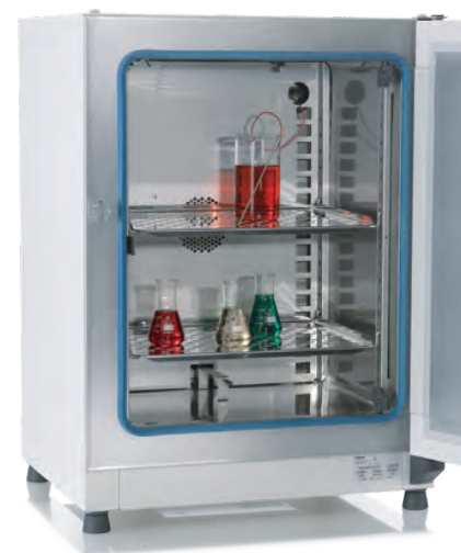
Heratherm Advanced Protocol Security Microbiological Incubator with unique dual convection and additional alarm systems, 100 L unit pictured

Incorporates additional safety features for ultimate sample protection