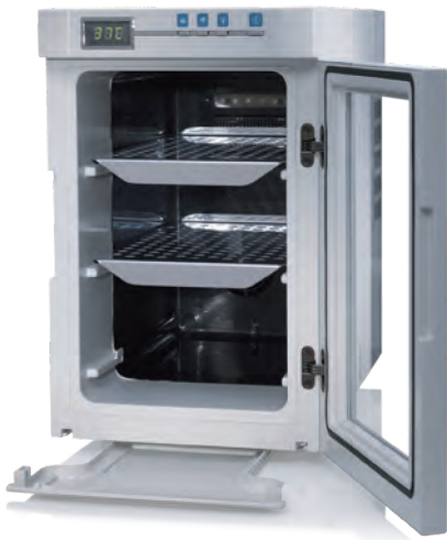
Heratherm Compact Microbiological Incubator, 18 L

The most compact unit of the Heratherm Microbiological Incubator family has an 18 L capacity, ideal for a personalized workspace