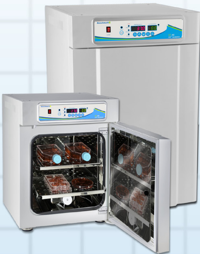
ST Series (ST-45 and ST-180)