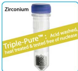
Triple-Pure™ (Molecular Biology Grade) Zirconium Beads