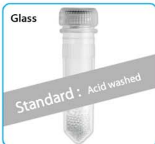
Standard Glass beads (Acid Washed)

* Supplied with US plug, for EU plug, please add (-E) to item number.