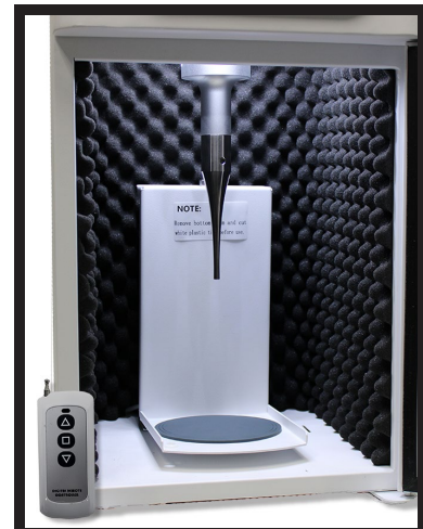
Soundproof enclosure with lights, motorized lift and remote control