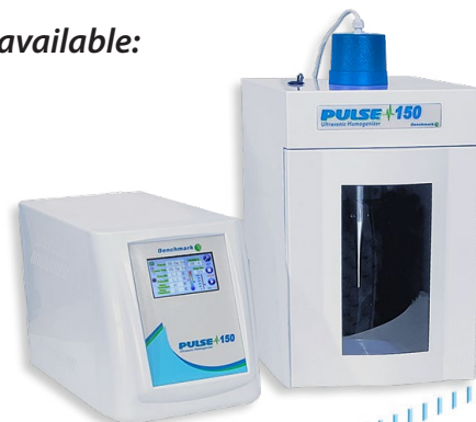
Pulse 150 Ultrasonic Homogenizer 150W for volumes to 150ml