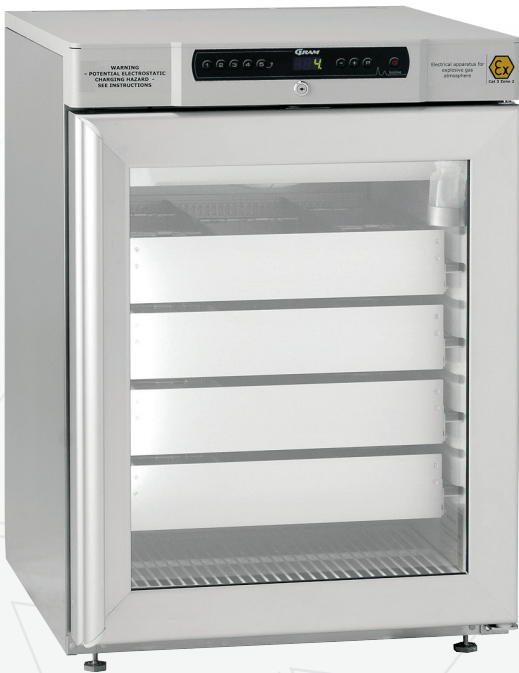
BioCompact II RR210. Drawers and glass door are optional extras.

Available in either white or stainless steel finish, with a one-piece moulded ABS inner lining. Shelves and drawers are mounted in U-shaped rails moulded into the plastic walls.