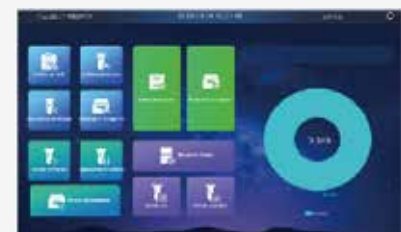
Professional version (optional)

The stored item management system was developed for users who use freezer racks, boxes and vials, the system can easily record the item locations, entry and exit records, facilitate item inventory and statistics with multi-screen interaction and reduce errors through secondary verification.