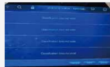
Single version (standard)

An accurate stored items management system was developed for users who don't use freezer racks, boxes and vials, the system easily records the items locations, entry and exit records and largely facilitate item inventory and statistics.