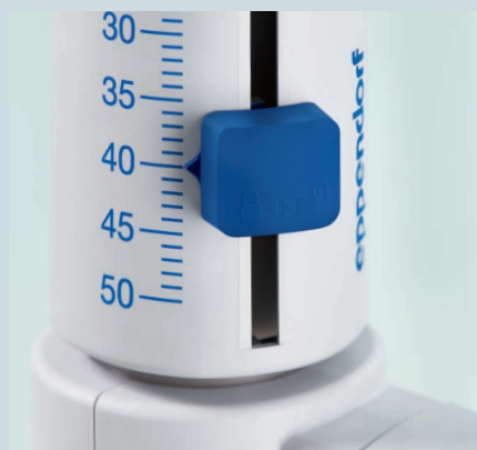
New! Ergonomically designed slide for smooth volume adjustment and fixation