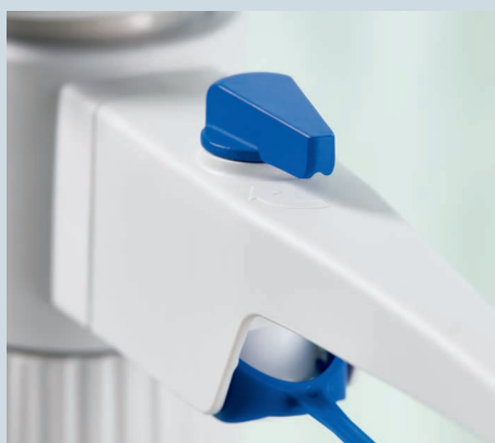
New! Perfected recirculation valve lever for easy setting of recirculation or dispensing position