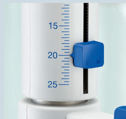
New! Optimized volume scale for clear visibility and precise volume adjustment