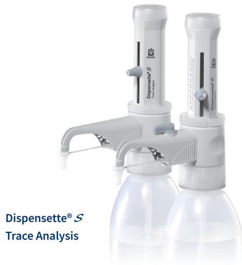
Dispensette® S Trace Analysis