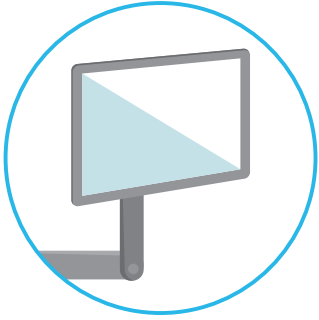
WORKSTATIONS (MONITORS & KEYBOARDS)

THE DISTEL DOSING SYSTEM IS INTENDED FOR THE CLEANING AND DISINFECTION OF SURFACES OF NON-INVASIVE MEDICAL DEVICES AND EQUIPMENT, AND OF HARD NON-POROUS ENVIRONMENTAL SURFACES SUCH AS: