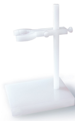
Bottle Stand PP. Full plastic construction. Support rod 325 mm, base plate 220 x 160 mm, weight 1130 g