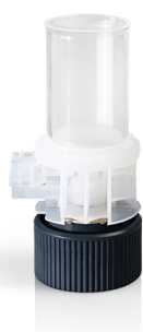
Dispensing cylinder with valve block