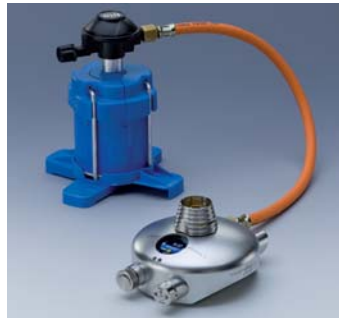
schuett phoenix II with C 206-adapter incl. pressure reducer and gas-safety hose as well as cartridge

Optional to operate with central gas supply (natural gas) or with gas cartridges (propane/butane)