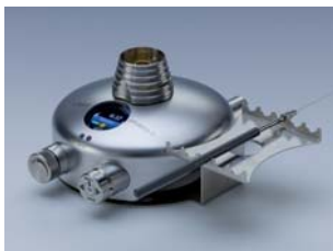
Instrument tray with inoculating loop holder, rotatable for optimum workplace convenience