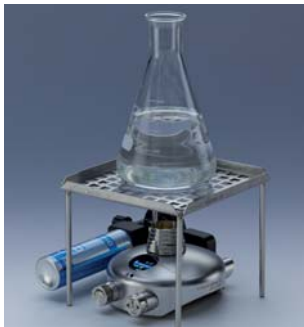
Hot-Tray with schuett phoenix II and CV 360-adaptor/cartridge for operation in chemical lab (height-optimized)