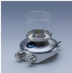
schuett phoenix II with glass spatter guard