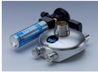
schuett phoenix II with CV 360-adapter incl. pressure reducer and cartridge

Sources of energy? You need it - we have it