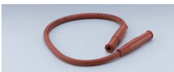
Gas-safety hose for natural gas, slip-on (DVGW-certified)

If the flame stops due to e.g. spilled liquids and the burner may not be re-ignited, the gas supply is automatically and permanently shut.