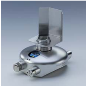
schuett phoenix II with flame shield