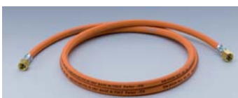
Gas-safety hose for propane/butane, screwed (DVGW-certified)

Sources of energy? You need it - we have it