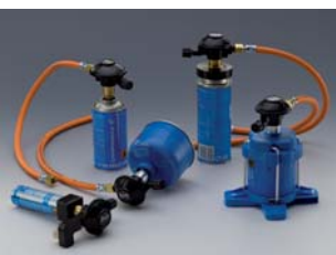
Choice of gas cartridges with adapters, partially including pressure reducer and gas-safety hose.