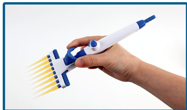
Shown with 8 Channel Pipette Tip Adapter (V0020-8)