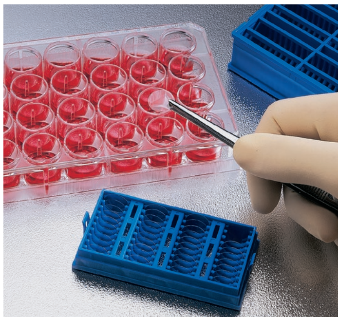
Convenient packaging also acts as a storage container and allows for easy coverslip manipulation