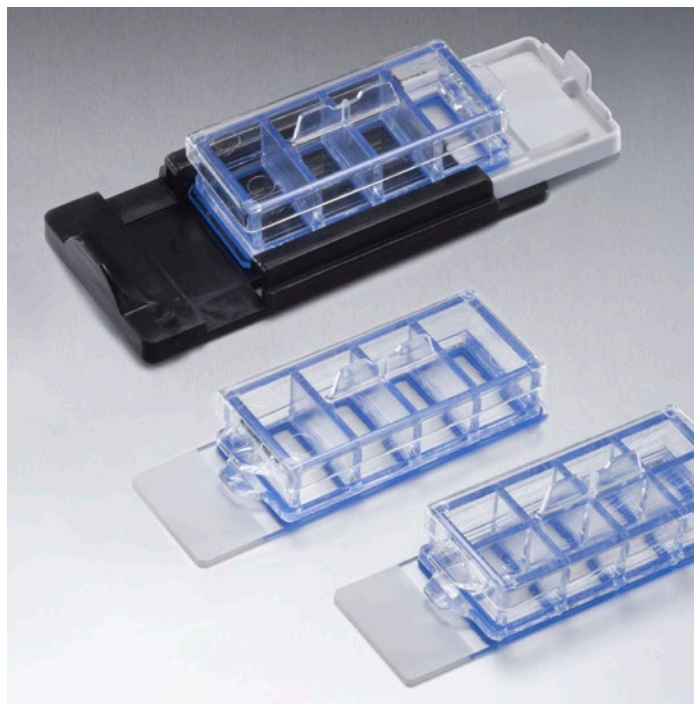
Falcon CultureSlides simplify vessel removal for microscopic analysis

In addition to our coated coverslips, Corning offers custom coating capability.