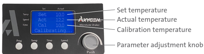
Figure 3. Calibration interface

NOTE: The instrument cannot enter into Calibration mode if the self-check is complete.