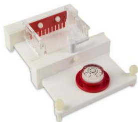
Figure 4 MS7-FC