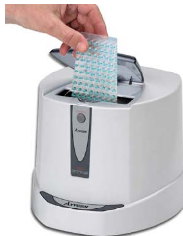
Proper loading of a PCR Plate