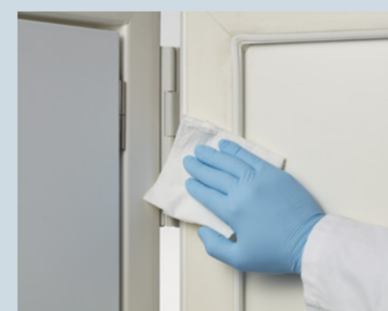
Wipe the outer door and its seal