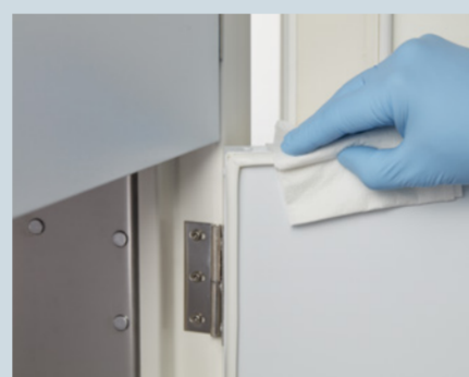
Wipe the inner doors and their seals