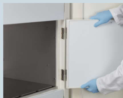
Remove inner doors for convenient cleaning