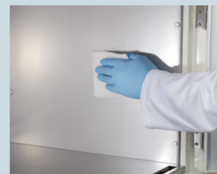
Wipe the inner chamber using a soft, lint-free cloth